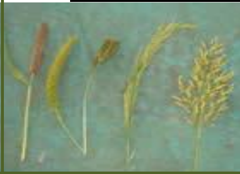
Drought resistant crops

LDCF/SCCF meets the costs of adaptation defined as additional costs over business as usual.