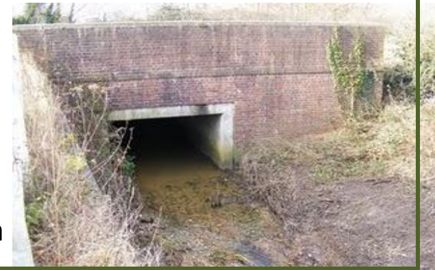
Change in infrastructure design